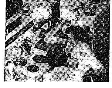
The scene yesterday in the grand ballroom of the Waldorf-Astoria when the 100 finalists in the Pillsbury baking and cooking contest started preparations on the 100 electric ranges set up for their use. Awards, with a top prize of $50,000, will be announced today.